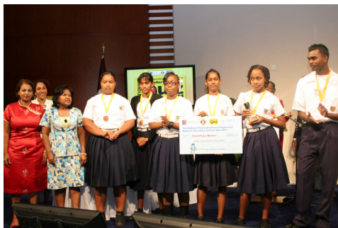
3 rd place winners- Vessigny Secondary School