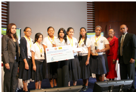
2 nd place winners- Naparima Girls High