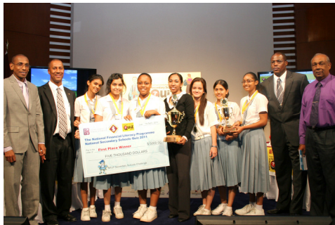
1 st place winners- St. Joseph Convent, San Fernando

POST OFFICE BOX 1250 PORT-OF-SPAIN, TRINIDAD, WEST INDIES TELE: 625-4835, FAX: (868) 623-1955 E-Mail Address: info@central-bank.org.tt